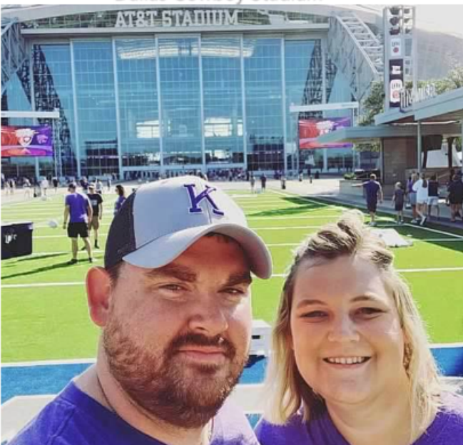
Dallas Cowboy Stadium