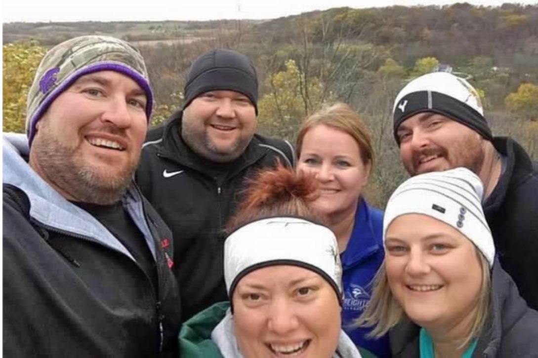
Trip with some friends and family to Iowa