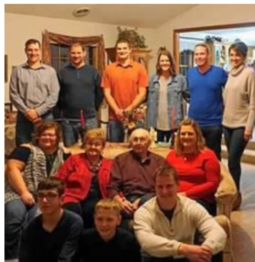
Christmas with Family