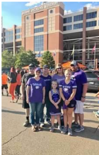
KSU game with Cousins