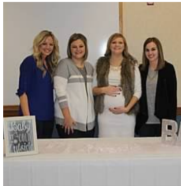
Cousin's Bridal Shower