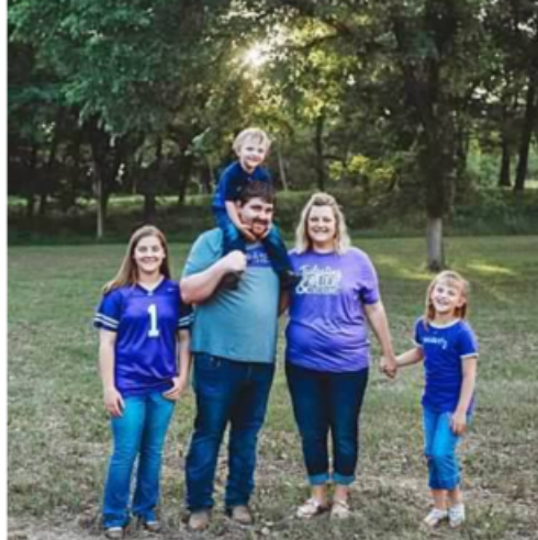
Concert with niece