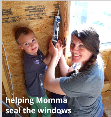
helping Momma seal the windows