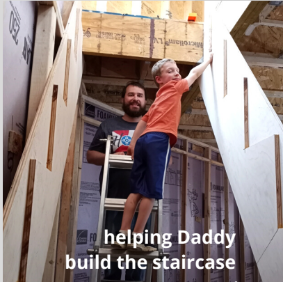
helping Daddy build the staircase