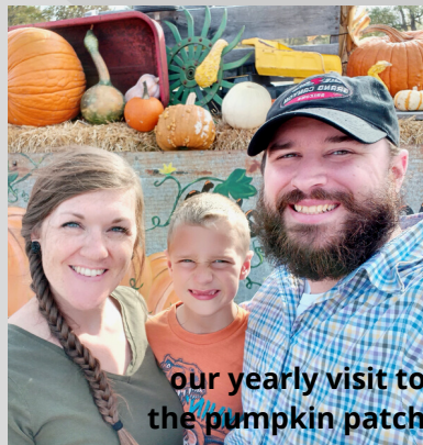
our yearly visit to the pumpkin patch