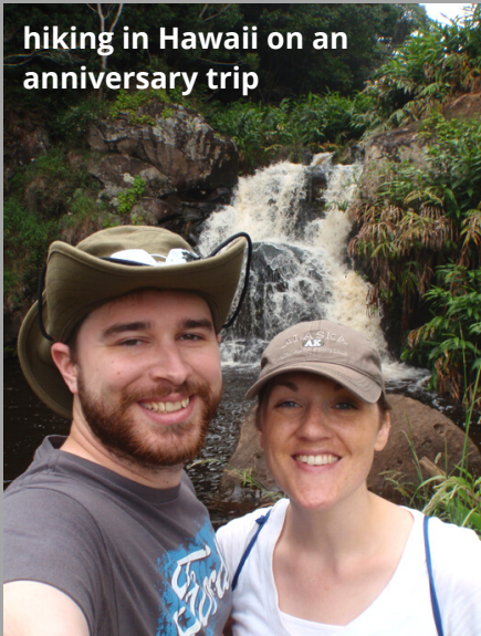
hiking in Hawaii on an anniversary trip