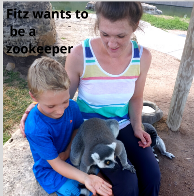
Fitz wants to be a zookeeper