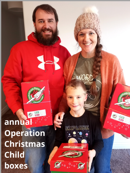
annual Operation Christmas Child boxes