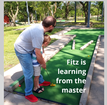
Fitz is learning from the master