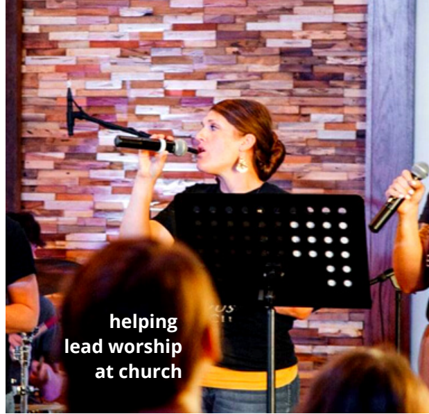
helping lead worship at church