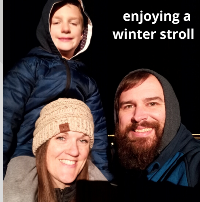
enjoying a winter stroll