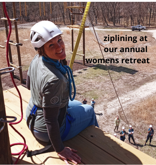
ziplining at our annual womens retreat