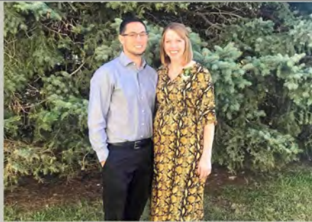
37 weeks pregnant with Huxley