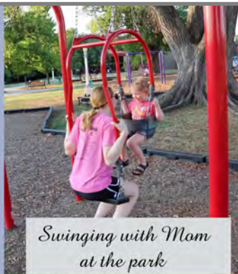
Swinging with Mom at the park