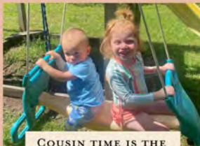
COUSIN TIME IS THE BEST TIME!