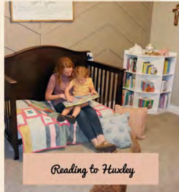
Reading to Huxley