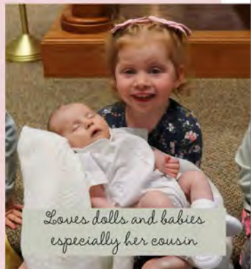
Loves dolls and babies especially her cousin