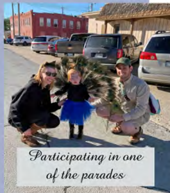
Participating in one of the parades