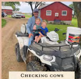
CHECKING COWS WITH GRANDPA