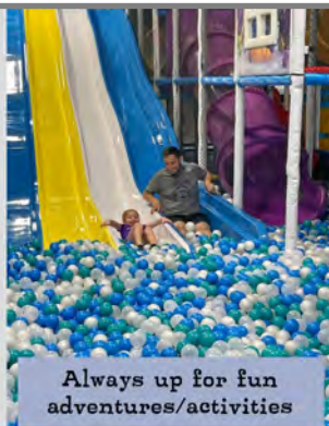
Always up for fun adventures/activities