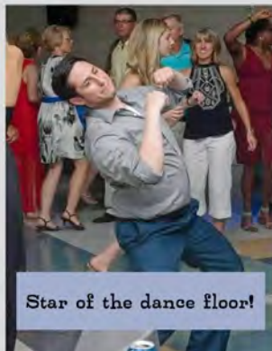
Star of the dance floor!

Favorites: Color-Blue Movie-Vegas Vacation Music-Christian Radio and the Piano Guys Activities-Swimming, Playing sports (especially soccer and golf) and watching sports, Doing woodworking projects, Dancing like no one is watching, Cooking and eating new foods