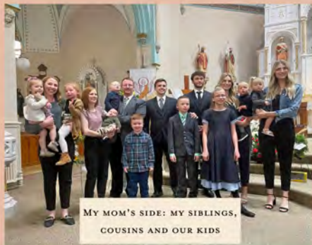
MY MOM'S SIDE: MY SIBLINGS, COUSINS AND OUR KIDS