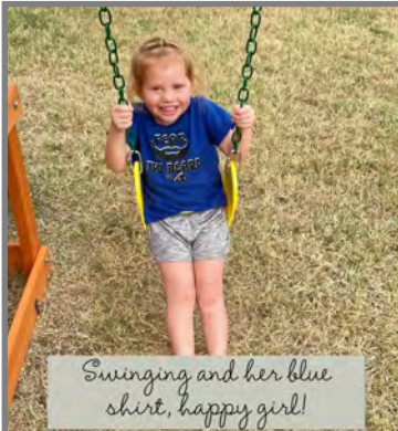
Swinging and her blue shirt, happy girl!