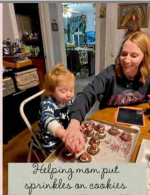
Helping mom put sprinkles on cookies