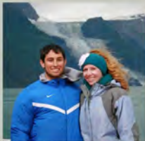
Vacation to Alaska