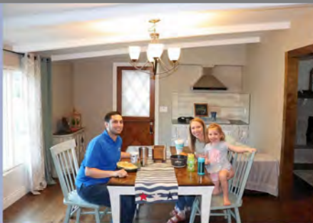
We always try to sit down and have supper as a family.