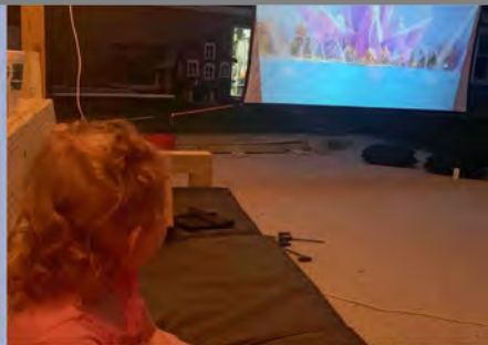
Watching a movie on the outside projector.