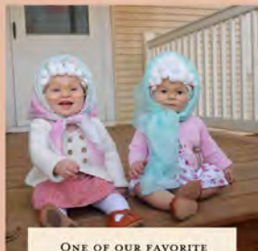
ONE OF OUR FAVORITE HALLOWEEN COSTUMES