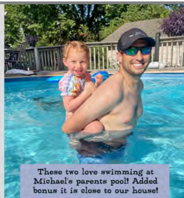
These two love swimming at Michael's parents pool! Added bonus it is close to our house!