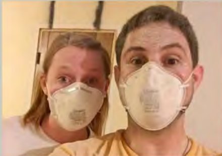
Couples that remodel together stay together