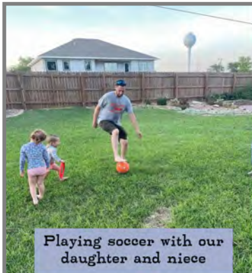
Playing soccer with our daughter and niece