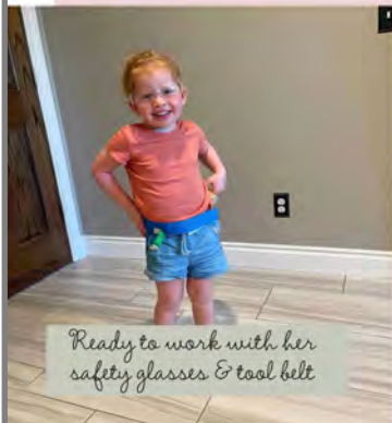
Ready to work with her safety glasses & tool belt