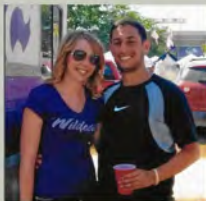
Our first picture together