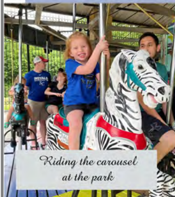
Riding the carousel at the park