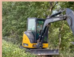
MY MATERNAL GRANDFATHER STARTED A DIRT WORK BUSINESS IN 1950. THE KIDS LOVE WHEN THEY GET TO GO FOR RIDES WITH MY UNCLE OR DAD IN THE EQUIPMENT.