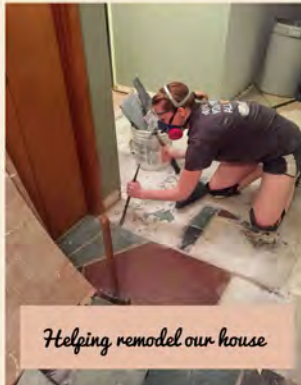
Helping remodel our house