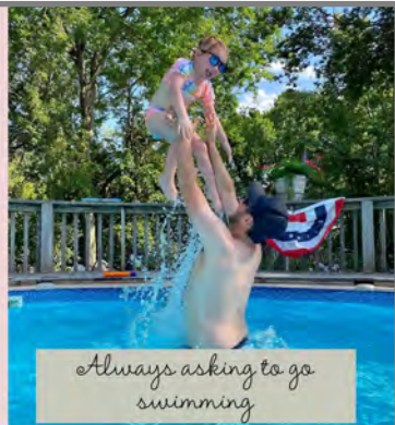
Always asking to go swimming