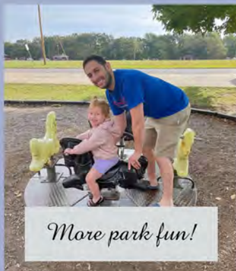
More park fun!