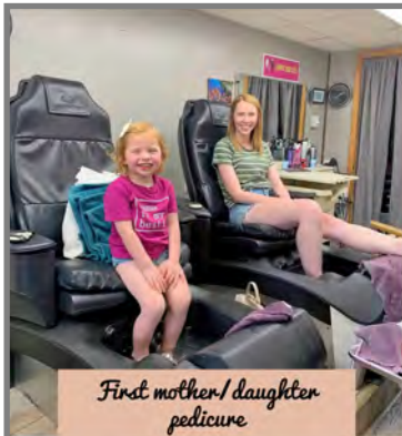
First mother/ daughter pedicure