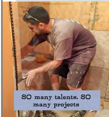
SO many talents, SO many projects