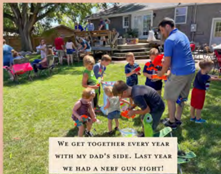
WE GET TOGETHER EVERY YEAR WITH MY DAD'S SIDE. LAST YEAR WE HAD A NERF GUN FIGHT!