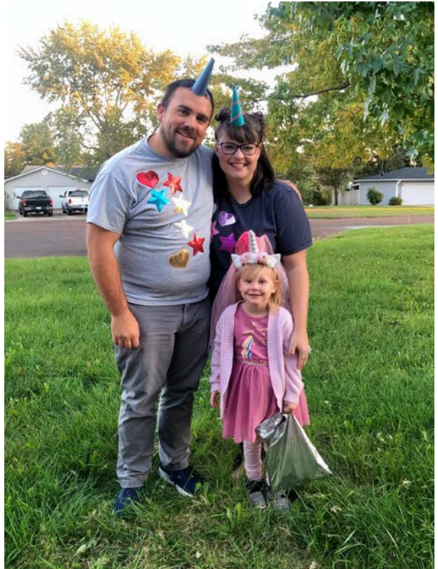
We dressed up as a family for Halloween and all went trick or treating as unicorns!