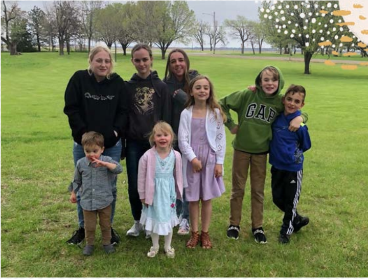
The grandkids at Mimi and Papa Jim's house at Easter following the annual Easter egg hunt!