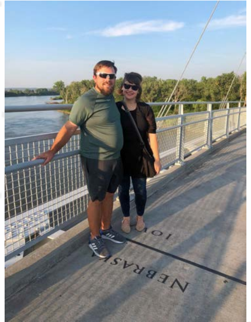
Vacation to Omaha, Nebraska in Summer 2019.