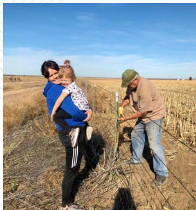
Helping fix fence at Papa Bruce's farm. Kansas can be a little windy!