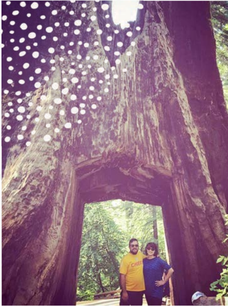
Exploring the Redwood Forest in California in Summer 2017.

We love taking trips and going on adventures!