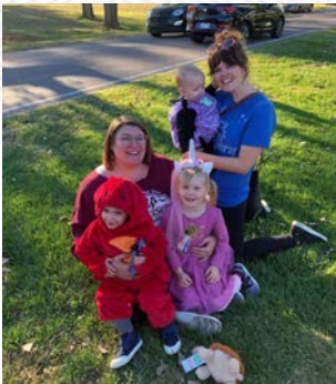
Trick or treating with cousins at the zoo